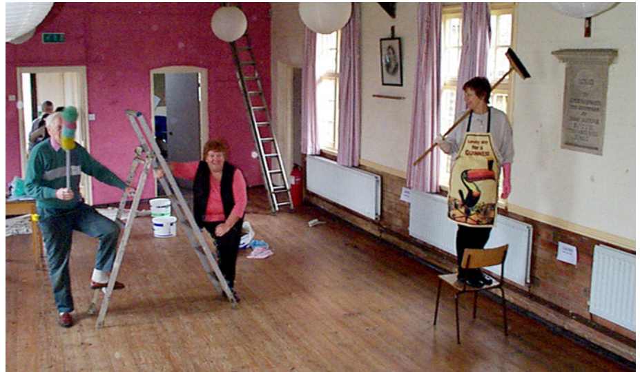
Some of the Hampton Lucy villagers who tackled the tough job of sprucing up the village hall