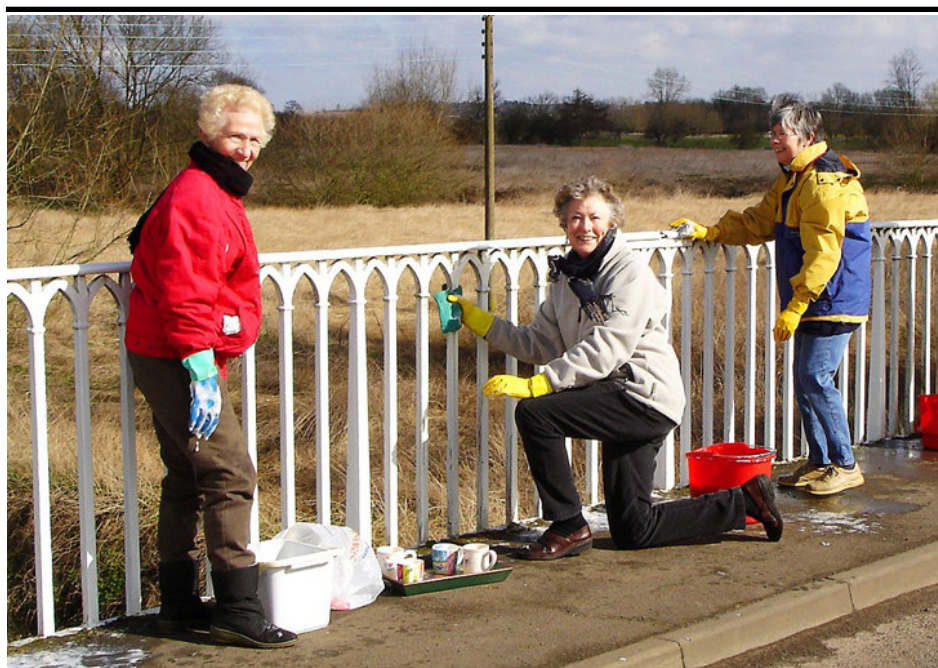
Some members of the Village Enhancement Group cleaning the Hampton Lucy Bridge