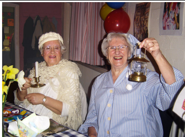
These two 'Wee Willie Winkies' in their night gowns were seen past eight o'clock at the 89th birthday party of the Hampton Lucy and Charlecote WI. Full report on Page 3.

Please note, Charlecote Fete will be held this year on Saturday, 7 June